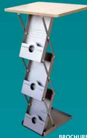
BROCHURE HOLDER WITH TABLE TOP