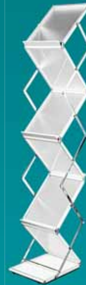
ALUMINIUM BROCHURE HOLDER